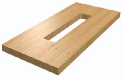
CUT HOLE IN WOOD