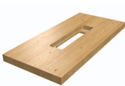
CUT HOLE IN BOTTOM

Rout/cut top of wood/stone/etc. for outlet bezel as indicated on template labeled "TOP TEMPLATE".