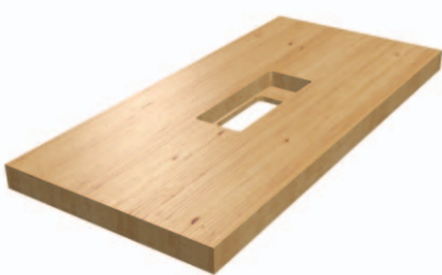
CUT HOLE IN BOTTOM

Rout/cut top of wood/stone/etc. for outlet bezel as indicated on template labeled “TOP TEMPLATE”.