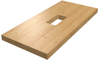
CUT HOLE IN WOOD